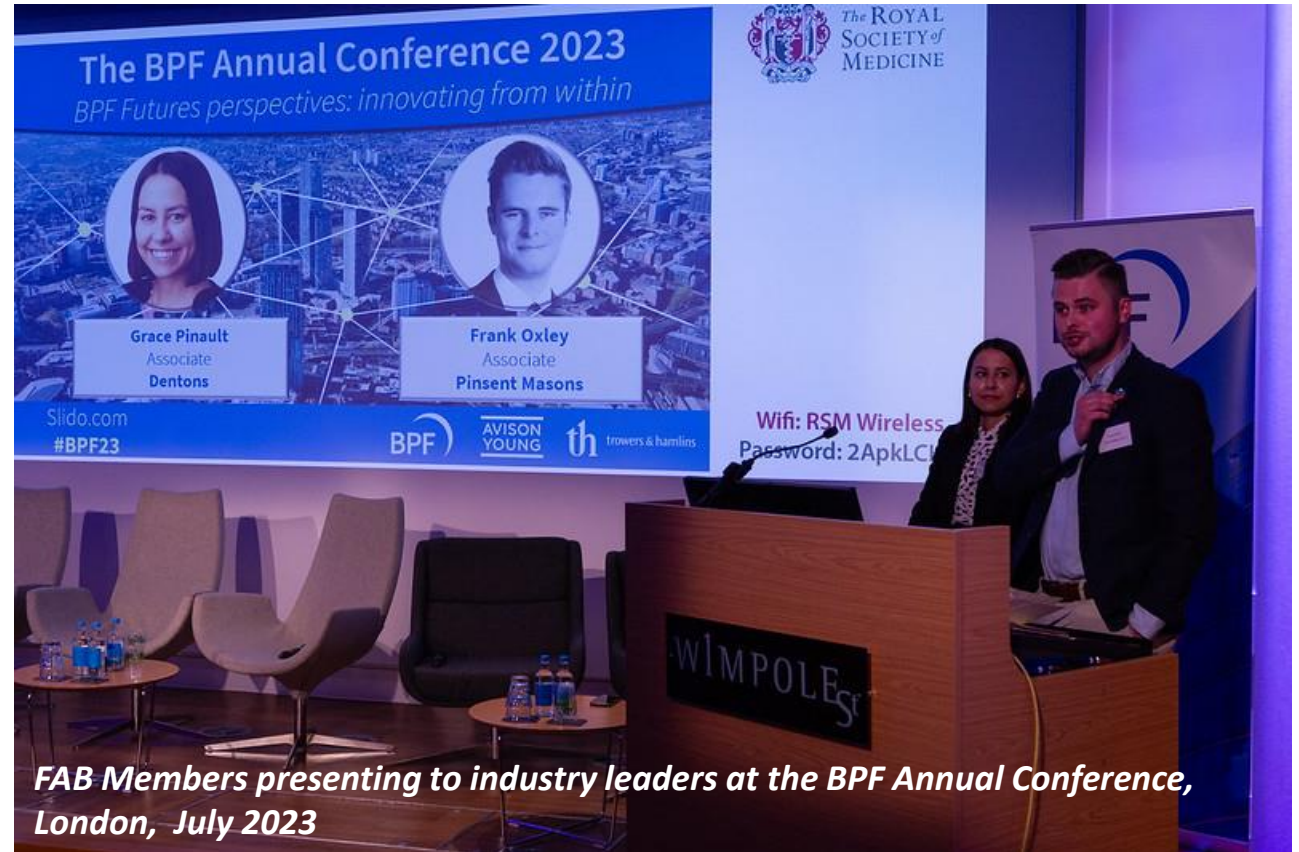
FAB Members presenting to industry leaders at the BPF Annual Conference, London, July 2023