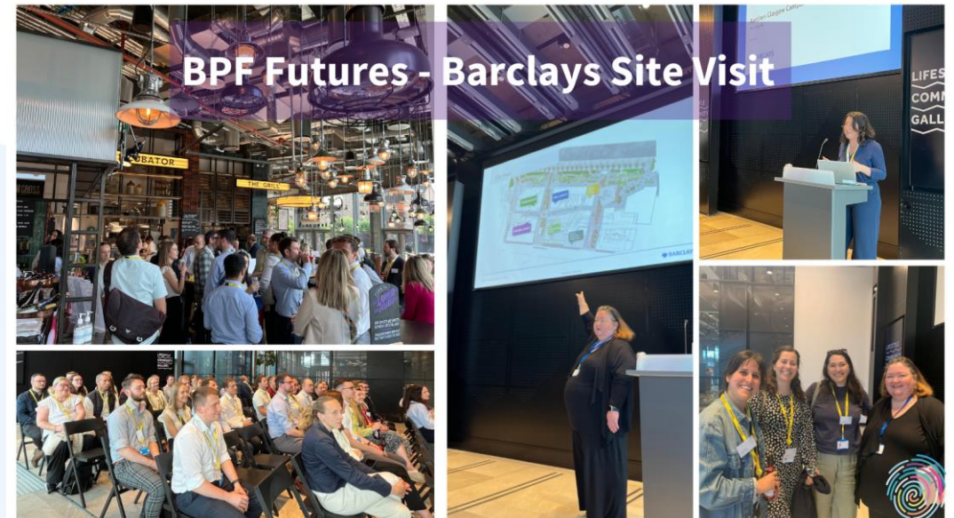
Hosting the Futures site visit to Barclays, Glasgow, June 2023